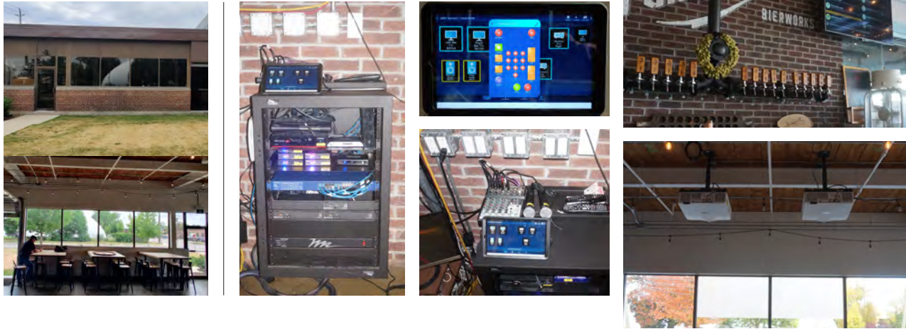
Before and after infrastructure update

Redesigning the existing A/V infrastructure had to accomplish two goals. First, it had to be easy for the staff to use and maintain. Second, the live video featuring their 20 plus beers on tap had to be displayed for everyone on the patio to see. A MuxLab Audio and Video IP streaming solution provided the flexibility and usability for the staff. With the click of a few buttons on a standard Android tablet, they can effortlessly route audio and video anywhere in the spaces. Plans are also in place to expand and they will be adding a few new endpoints which will be extremely cost efficient.