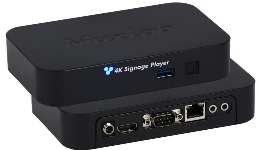
HDMI 2.0 Digital Signage Media Player (500769)