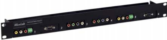
Fully loaded - front view