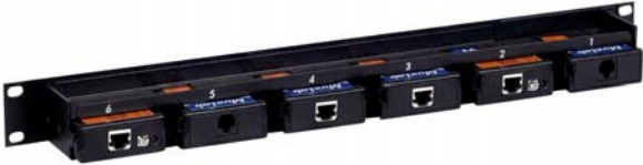
Fully loaded - rear view