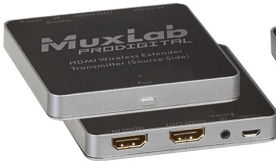
Transmitter (Source Side)