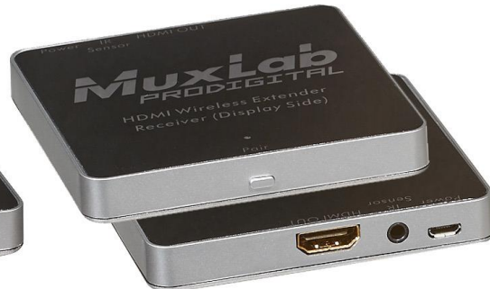
Receiver (Display Side)