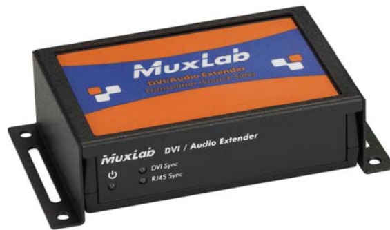
With transceiver installed