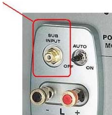
RCA Input on powered subwoofer

For more information, please contact MuxLab Customer Technical Support at 877-689-5228 (North America) or (+1) 514-905-0588 or at videoease@muxlab.com or visit http://www.muxlab.com/ .